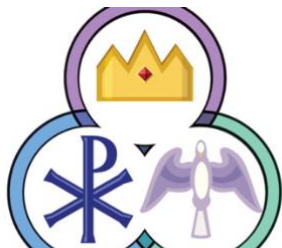
THREE IN ONE